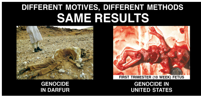
CBR's new Darfur sign will add relevance