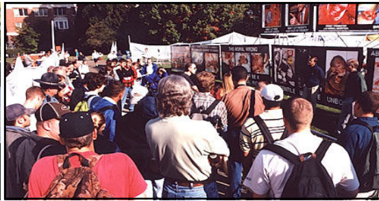
The unlawful: Bed sheets circle display