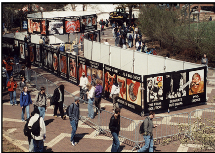
GAP sees high student traffic

Juxtaposing abortion pictures next to pictures of the Holocaust and lynching gets students attention, but it also puts an unforgettable image of "choice" in their heads. The controversy over GAP piques student and alumni curiosity and drives them to discuss abortion with our trained debate team members. The result is GAP reaches more students in a few days than most college professors reach in a lifetime of classroom lectures. Additionally, the "ripple effect" of GAP often results in entire classes discussing GAP. Dorms buzz with discussions about abortion. Bloggers feverishly express their opinions via the web. Media coverage abounds. The fact is business as usual ends when GAP visits a campus because the administration no longer holds the trump card on the proclamation of truth.