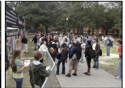
Stephanie Gray is one of the best pro-life speakers and trainers in the classroom, and on campus.

HELP US COVER THE COSTS OF CBR'S PRO-LIFE INSTITUTE. WE NEED TO RENT A TRAILER TO HAUL ALL THE AV EQUIPMENT TO AND FROM CAMPUS. WE ALSO NEED TRAINING MATERIALS. YOUR GIFT OF $50, $25, OR $10 HELPS PAY FOR THE EXPENSE OF TRAINING STUDENTS THIS FALL.