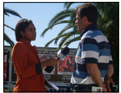
Media ripple adds affect

THE RECESSION HAS AFFECTED OUR MINISTRY. HOWEVER, WE ARE MAKING FINANCIAL SACRIFICES IN ORDER TO KEEP SAVING BABIES. YOUR GIFT OF $1000, $500, OR $250 HELPS COVER TRAVEL EXPENSES FOR CBR'S DEBATE TEAM MEMBERS.