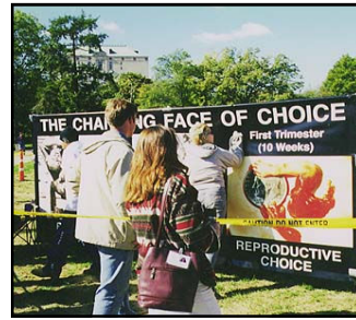
The violent: A protester attempts to cut our signs