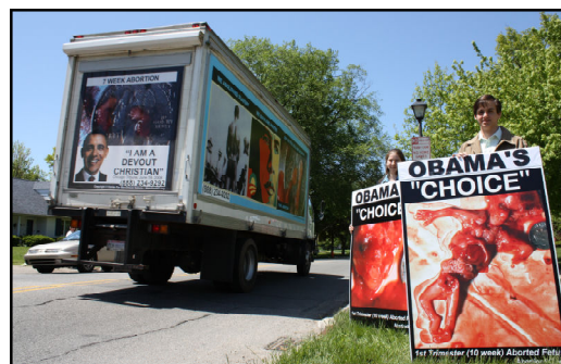
At UND's main gate, volunteers hold CBR's new Obama's Choice signs as our billboard truck passes by