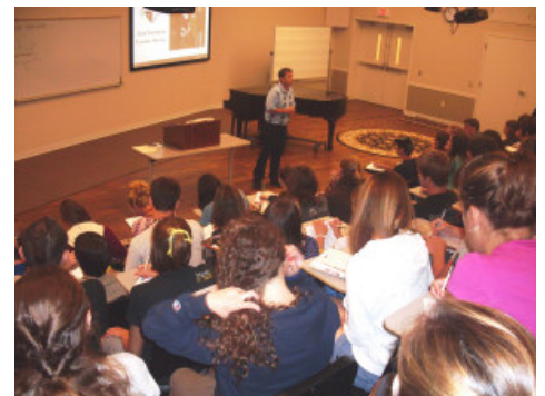
Pro-Life Institute equips students.

CBR is unveiling dozens of new GAP signs to educate the American public, university students, and the Congress on the deadly aspects of ObamaCare. Several hard-hitting new signs are coming online NOW. Lord willing, and with your help, we will be ready to fight back immediately. Enclosed you will find a sampling of CBR's new Obama Awareness Signs. By supporting us, these signs will become a new addition to CBR's campus outreach—the Genocide Awareness Project (GAP). Because college age youth virtually worship President Obama, combining some Obama signs with the traditional GAP signs will create even more controversy, helping us to educate more students on the abortion issue and derail abortion funding in ObamaCare. CBR's message is "Abortion is not health care!"