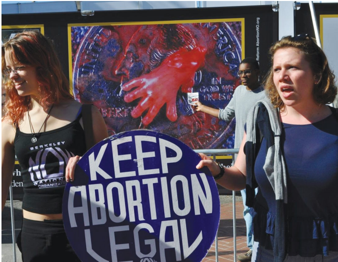
Our signs vs. their signs

OUR WINTER GAP TOUR WILL GO TO FOUR LARGE FLORIDA UNIVERSITIES. THIS TOUR WILL COST CBR $30,000. YOUR GIFT OF $550 PAYS FOR TRUCK AND CAR FUEL FOR ONE FULL WEEK.